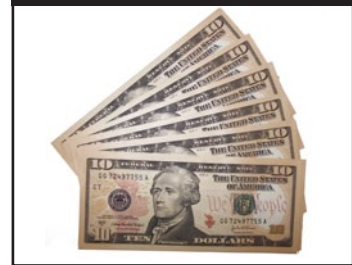
Clear graphic display